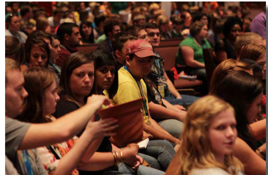
Students take part in giving. In 2012, more than $135,000 was given for missions and evangelism by young people at Falls Creek.