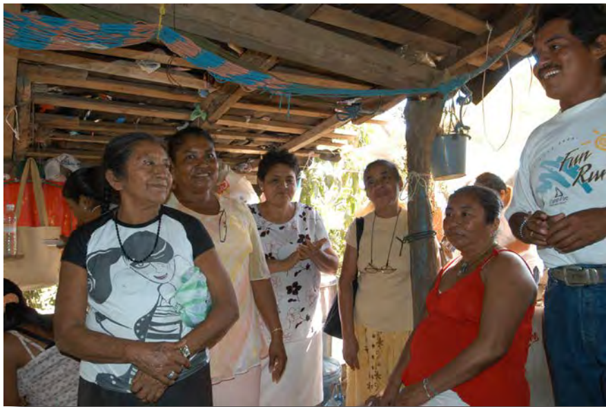
The BGCO has successful partnership missions in Colorado, Mexico, and East Asia.

BCM works on 38 campuses across Oklahoma. This year 12,480 students were impacted by BCM with 4,473 active in the ministries. On college campuses, 170 students received Christ and another 425 received Jesus through the various ministries of the students. More than 860 students participated in mission opportunities across North America and in 20 nations.