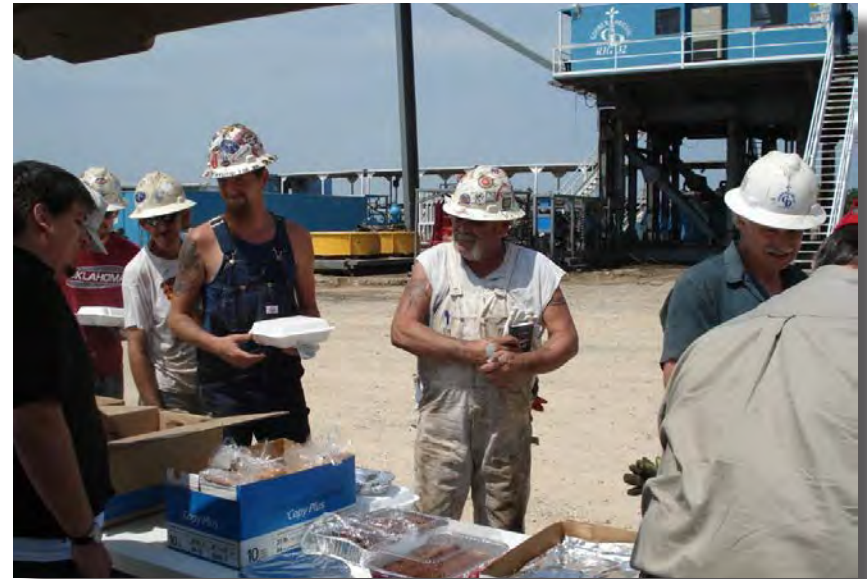
Calvin Baptist Church ministers to a group of oil rig workers through oil patch chaplaincy.