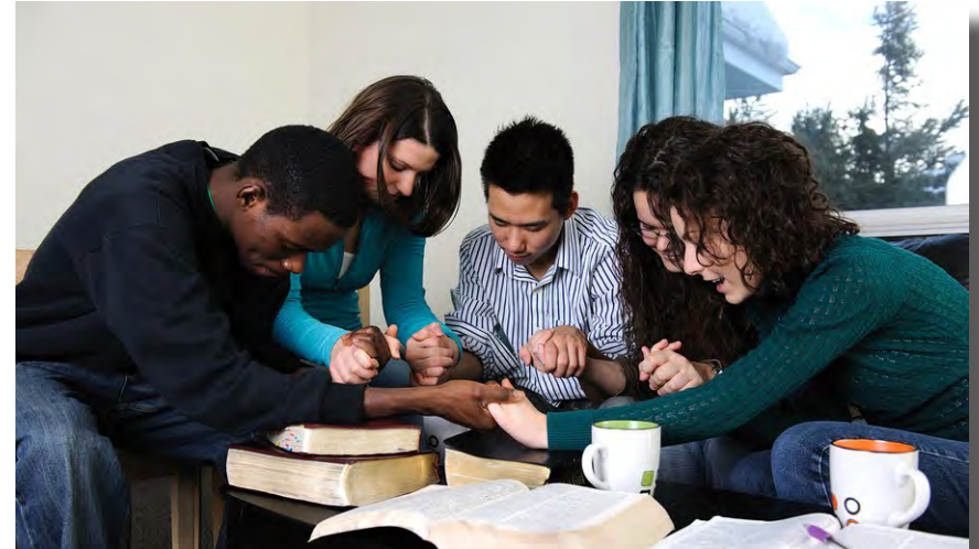
The BGCO is launching an initiative in 2013 called "ReConnect Sunday School."