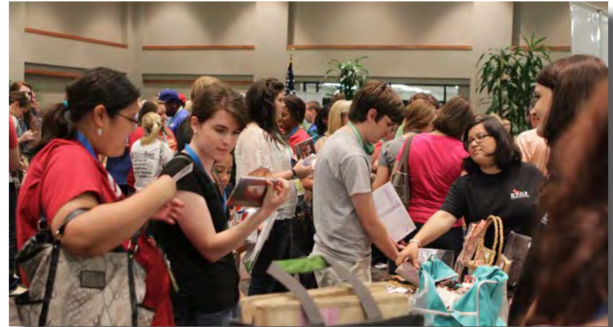
More than 600 college students from throughout Oklahoma learned about ministry opportunities at Momentum.