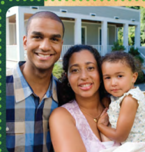
Men, Women and Family Ministries