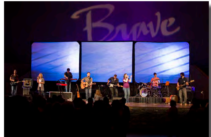
Oklahoma women were challenged at the 2012 Ladies' Retreat to be "Brave" in Christ.

More than 3,000 men attended this year's Rewired Men's Retreat where many came to faith in Jesus Christ. More than 20 different venues were offered to help men with their spiritual development. Venue leaders put together a four to six week discipleship study that accompanied their topics and made available to men on the Rewired website or iPhone App. Another positive indicator this year was a large increase of young men between the ages of 13-18.