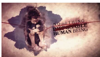
Imago Dei: The Image of God