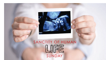
Sanctity of Human Life Sunday